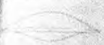
TYPE A, DISC SHAPED, ON FOUR LEGS SIDE VIEW