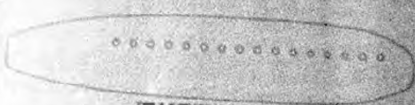
TYPE C, PLEATED OR CORRUGATED SIDE VIEW