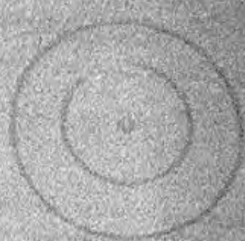
TYPE B, DISC SHAPED, ON FOUR LEGS SIDE VIEW